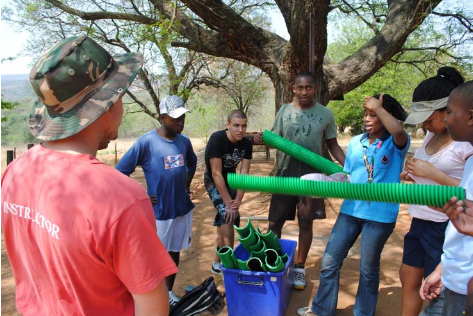
IEDT Camp – Kloofwaters 2010

We hope, that through the IEDT programme, we are training up the future leaders of tomorrow and we are of the opinion that our learners are well on their way to shaping the future of South Africa!